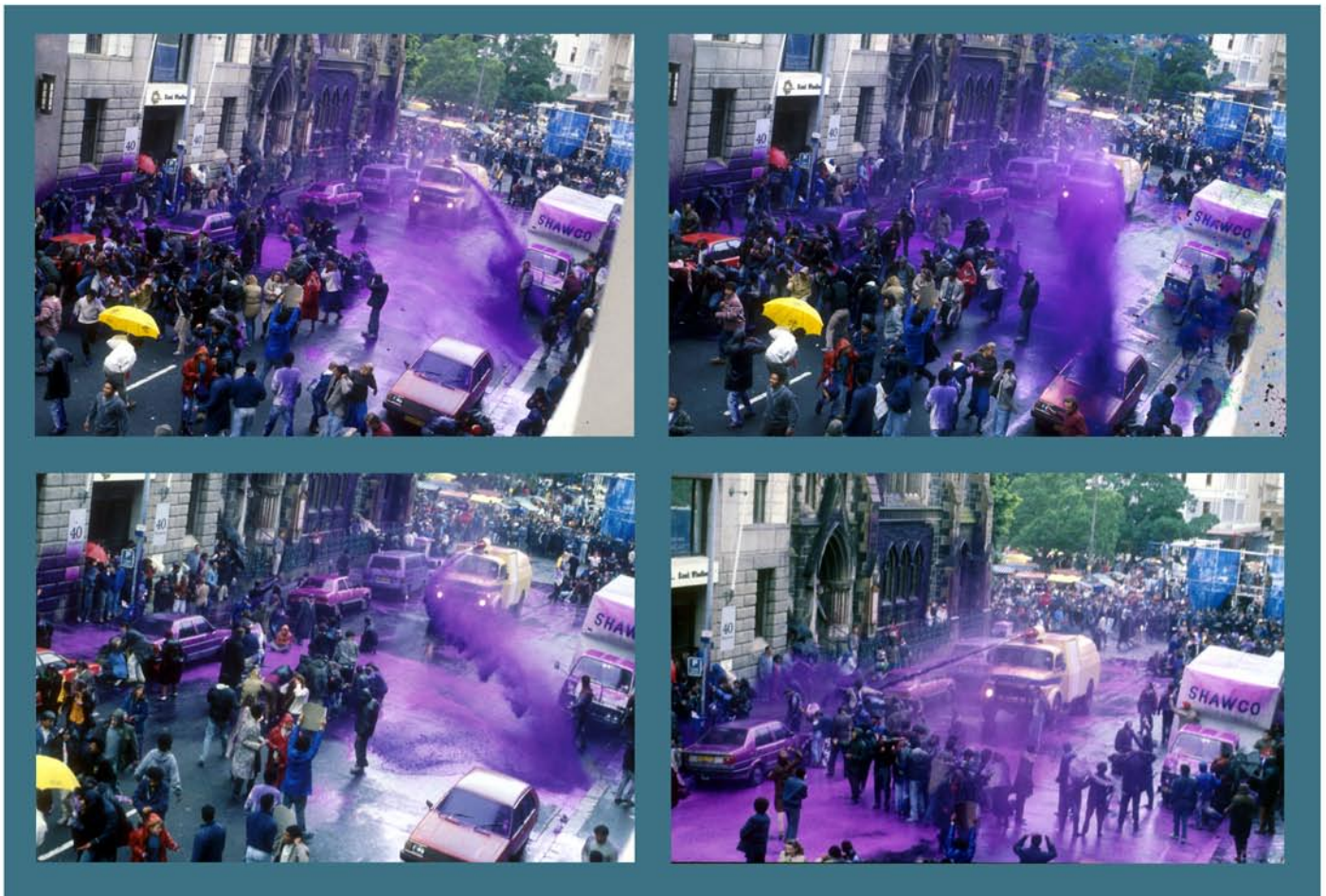
The police water canon moves in to disperse a demonstration, protest in Burg Street outside the National Party Offices. This time, the cannon fired a purple dye. Obed Zilwa